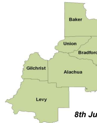
8th Judicial Circuit