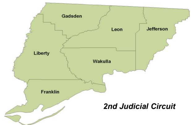
2nd Judicial Circuit