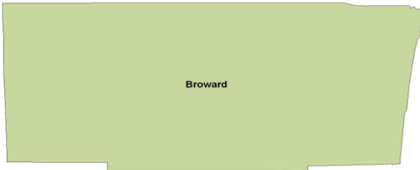
17th Judicial Circuit