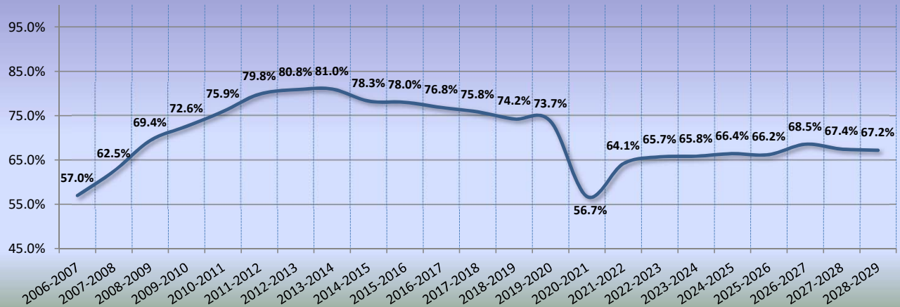
Program Year Participation Rate