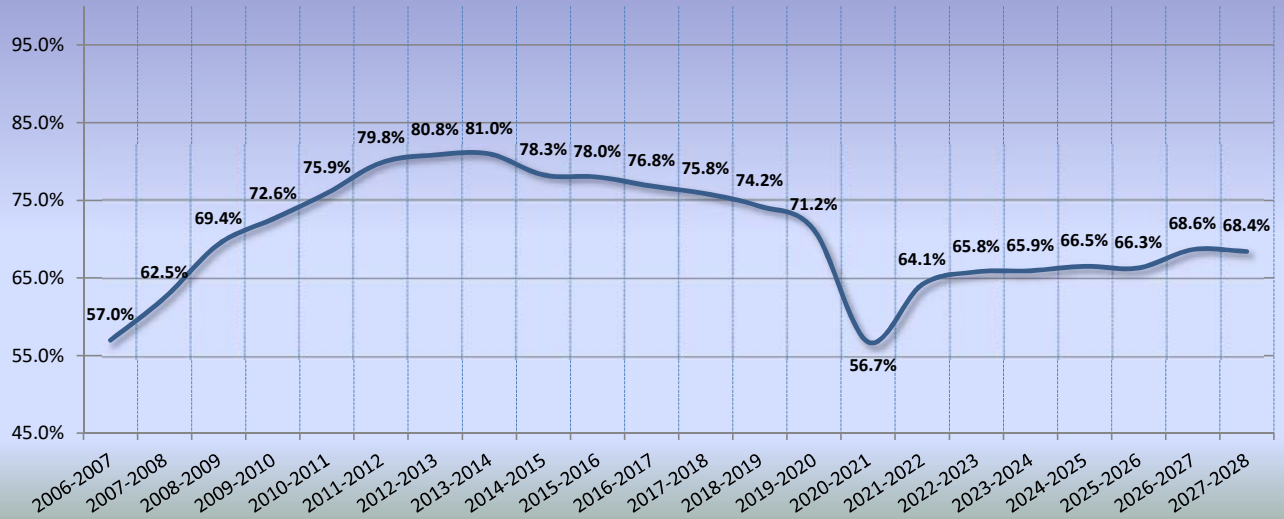
Program Year Participation Rate