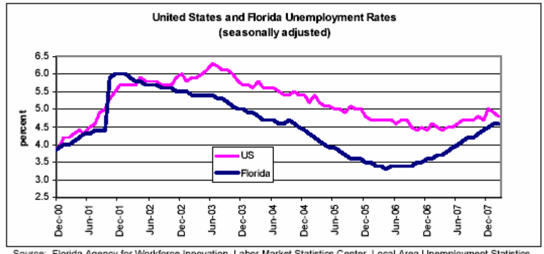
Source: Florida Agency for Workforce Innovation, Labor Market Statistics Center, Local Area Unemployment Statistics program.

Weaker Employment Conditions in the Short-run... According to the latest nationwide data, Florida was losing jobs (a job growth rate of -0.3% in February) while the nation as a whole stayed weakly positive (+0.6%). Florida's rate represents a loss of 27,700 jobs compared to last February; however, the state's negative over-the-year growth rate actually began in September 2007. Seventy-two percent of the state's job losses are due to the construction downturn. Overall employment is projected to decline -0.1% in Fiscal Year 2007-08, increase to 0.9% in Fiscal Year 2008-09, 2.2% in Fiscal Year 2009-10, 2.4% in 2010-11 and then return to 2.3% in 2011-12.