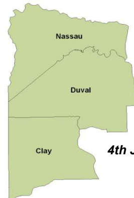
4th Judicial Circuit