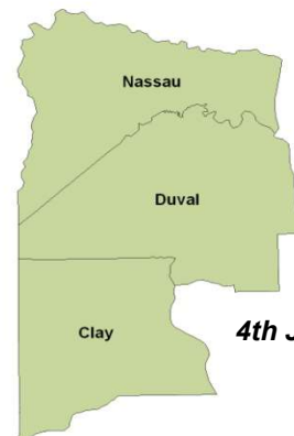
4th Judicial Circuit