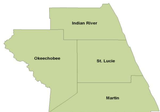
19th Judicial Circuit