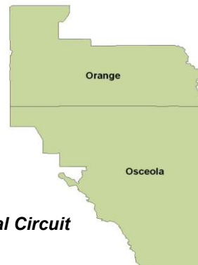
9th Judicial Circuit