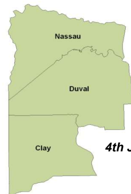
4th Judicial Circuit