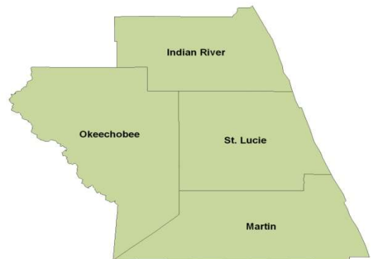
19th Judicial Circuit